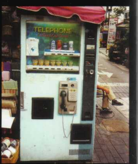
Seoul. This is a rare phone too. Its location is probably even more rare.